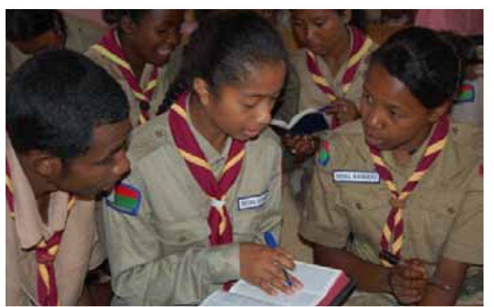
↑ Malagasy rangers studying the Bible

is a year of translation of materials and meetings with our national committee to give Rangers a strong start. Currently every church must translate every lesson every week into Malagasy for their leaders. This is very tedious but the motivation it very high. Pray that God continues to give us wisdom and guidance as we move forward."